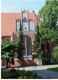
↑ St. Georg's Church