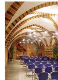
↑ Cellar of the City Hall

With the core of its structure, the city hall Parchim dates back to the 14th century. Its today's appearance was achieved only in 1818 by a profound reorganization by the country and court master builder J. G. Chr. Barca who also designed the impressive portal on the church side of the building. While the repeatedly jointed three-sided show gable at the market side had to be pulled down due to dilapidation, the side to the Waagestraße with the stairs gable and the fivefold blank faceplate group still has well the original appearance. Even the impressive Gothic cellar has been well preserved, with its cross-ribbed vaultings which are supported in the room middle by massive octagonal pillars. The clock at the city hall gable on the side towards the Old Market became attached in 1869 as a synchronized clock for the town.