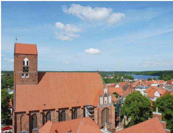
↓ St. George's Church with the Wockersee in background

The St. Georg's church is located in the very heart of Parchim that received its town charter in 1220. In 1229, the church was mentioned for the first time. Its style was late-Romanesque, without tower or transept. It burnt down completely in 1289, but the new replacing Gothic church was sanctified already in 1307. In the same century, it was complemented by the ambulatory and extensions in the South and North. The last comprehensive restoration was carried out in 1898.