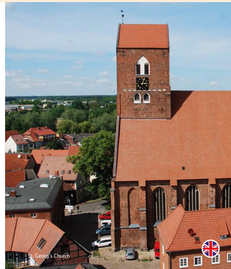
St. George's Church